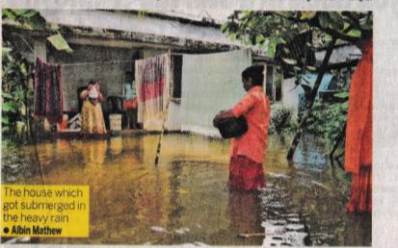
The house which got submerged in the heavy rain.