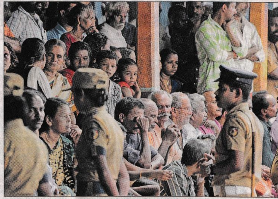
Inmates of a relief camp at Elanthikkara wait for home minister Rajnath Singh and CM Pinarayi Vijayan on Sunday. (R) A woman drains out water from her house at Eloor