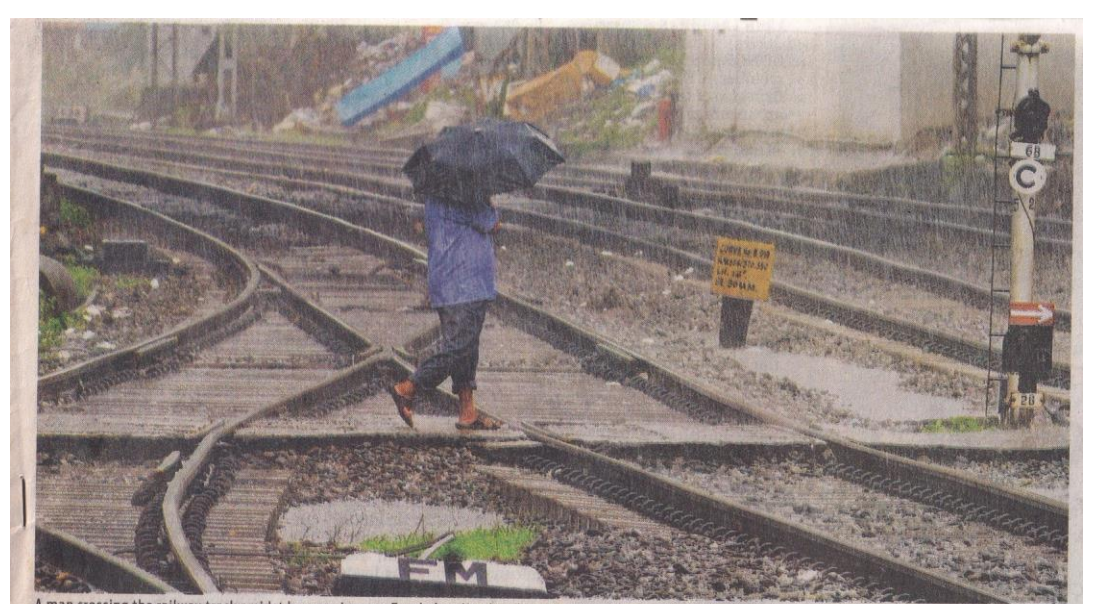
A man crossing the railway track amidst heavy rain, near Ernakulam North railway station on Wednesday. Major roads in the city have been waterlogged after the incessant rain | A SANESH