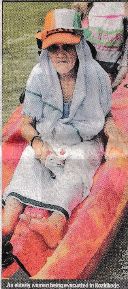
An elderly woman being evacuated in Kozhikode