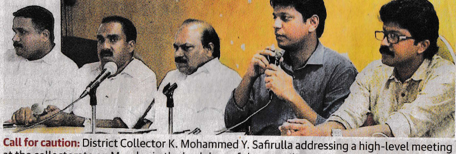
at the collectorate on Monday in the backdrop of the prevailing situation in Idukki and Idamalayar dams.

Alerts over the release of water from dams, if the situation so warrants, will be published well in advance on the Collector's official Facebook page www.facebook.com/dcekm. Official communication from the government will also be disseminated through print, audio, and visual media. Besides, public announcement will be made to reach out to people along the